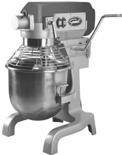
GEM120 20 Quart Mixer